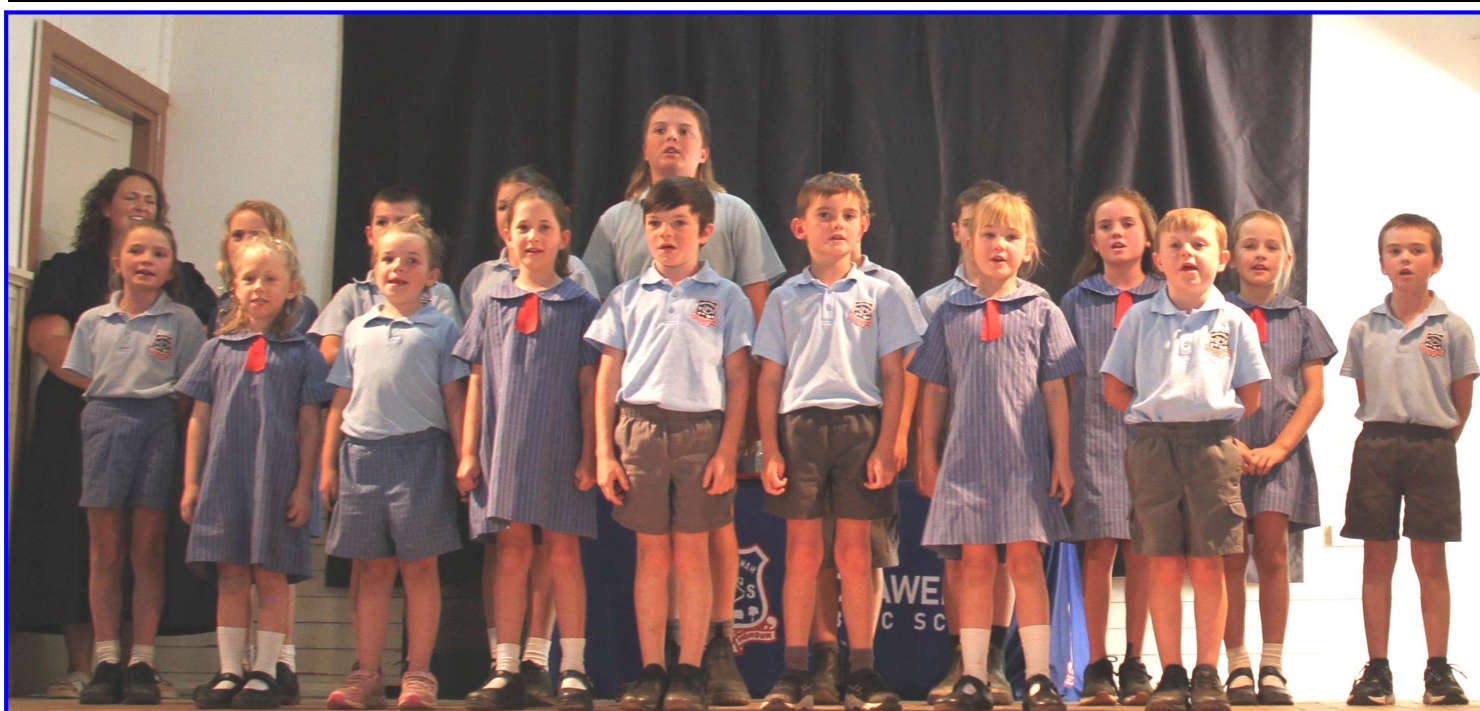
TPS Students presented the Christmas carols "Rudolph the Red Nosed Reindeer" and "We Wish You a Merry Christmas".